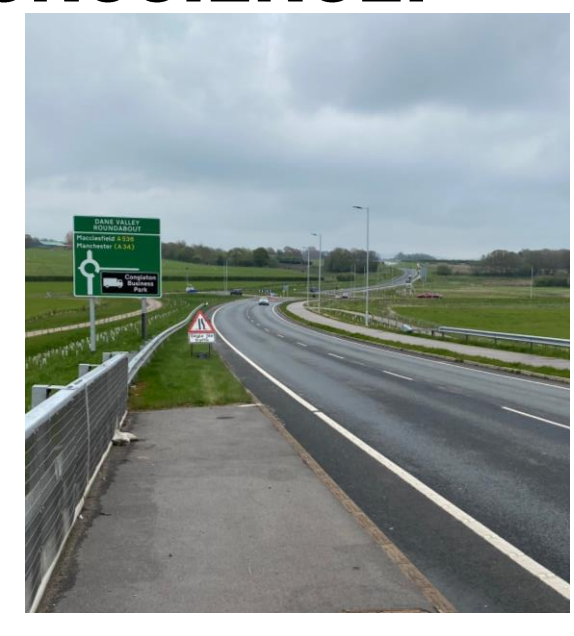
Congleton Link Road - an empty solution

It's time to have councillors who are ready with 21st Century Solutions.