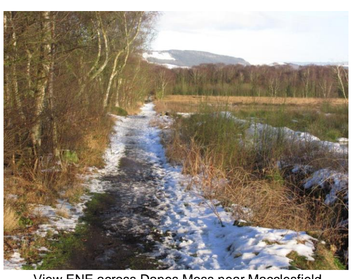
View ENE across Danes Moss near Macclesfield